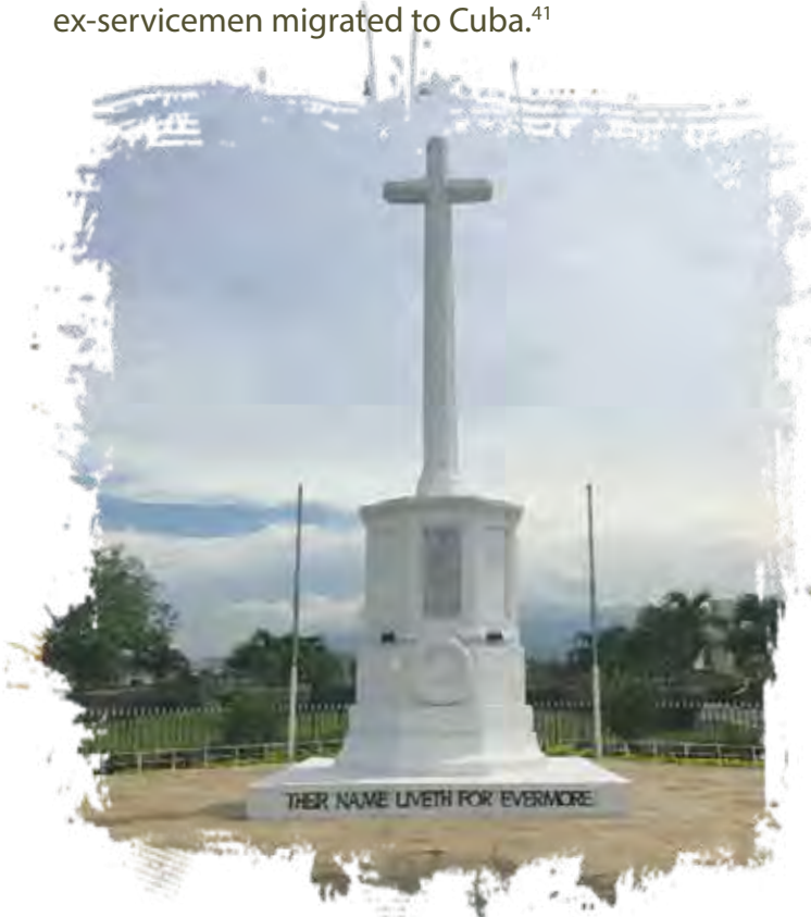
The National War Memorial in Kingston, Jamaica, unveiled in November 1922.

Now the Germans Lies and Slumbers Never more to shoot an' slay Never shall the 'rais' to fight us Peace on earth good will to men 42