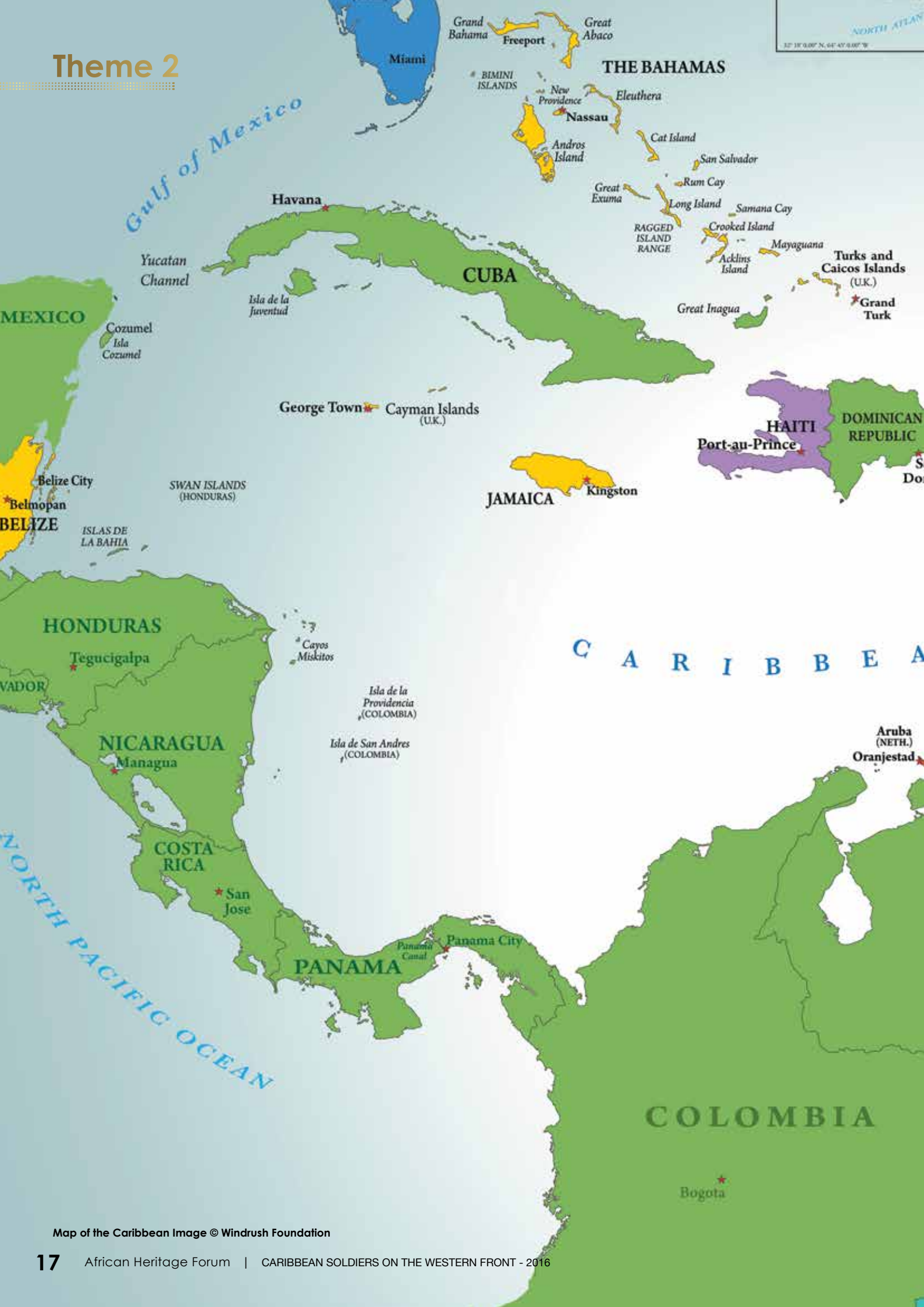
Map of the Caribbean