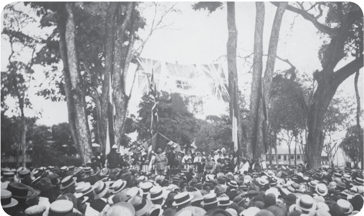
A recruiting meeting in Port of Spain, Trinidad, 1916