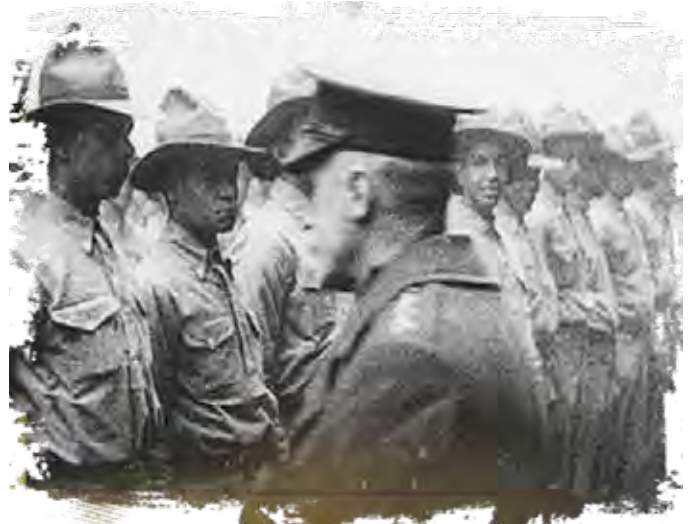
The inspection of the First Trinidad Merchants' and Planters' Contingent in London in 1915