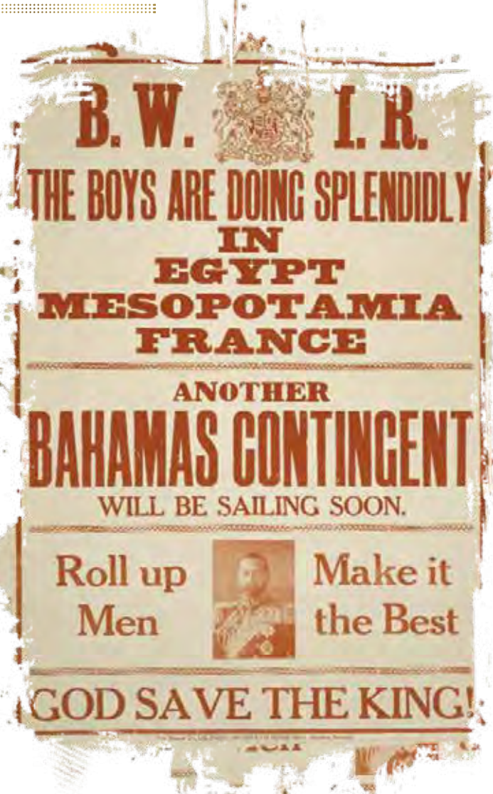
An example of a recruitment poster used to encourage Bahamian men to volunteer

Black Nationalists, who wanted self-government, argued that Blacks should fight against Germans to show their superiority against them. Marcus Garvey, founder of the Universal Negro Improvement Association (UNIA), encouraged men to join up. On 16 September 1914, he sent the Colonial Secretary, Lewis Harcourt, a telegram expressing his support. A meeting of Garvey's UNIA, held in Jamaica, with some of the BWIR present, spoke against German atrocities in Togoland and whipped up the threat of German ships raiding the islands for coal and eventually invading. 4