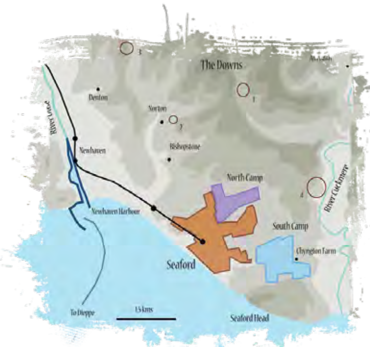
Seaford town, England 1911, two camps. Red circles indicate training areas. Numbers refer to the section on Training Facilities.

C ontingents of Caribbean recruits began to arrive in England from October 1915 and were initially based either at North Camp in Seaford, Sussex or Withnoe Camp in Plymouth, whilst awaiting a decision regarding their deployment. The war in Europe had developed into a stalemate and it would have been expected that the Caribbean volunteers would be allowed to serve and fight in the armies along the Western Front of France and Flanders.