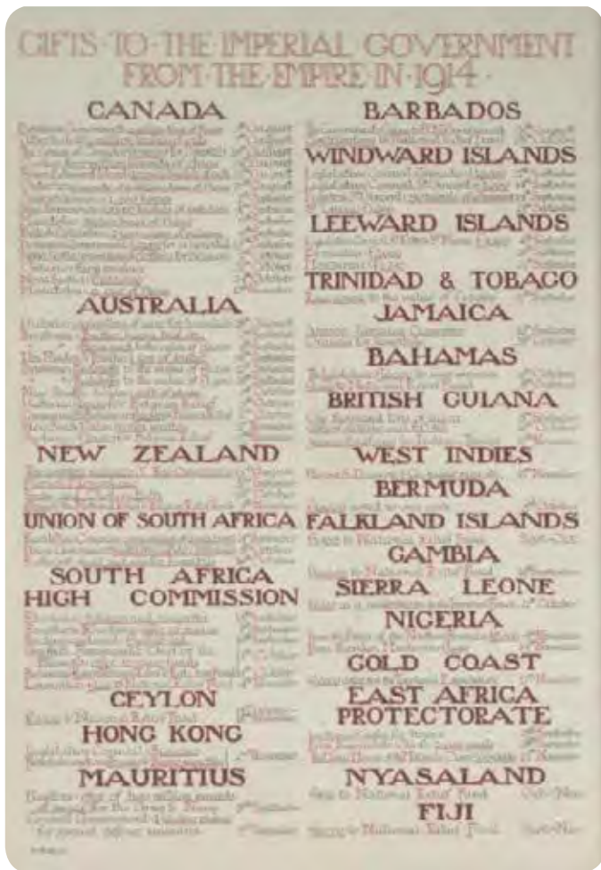
This scroll lists contributions of food, clothing and money from the West Indies and other parts of the British Empire.

Notably, the rejection of the suggestion of a Black Contingent was not intended for white Caribbean men who wished to enlist. Many had already paid their own passage on ships and joined British and Canadian units with the blessing of their colonial governments and were accepted into the army. 8 Despite the official obstacles, some Black Caribbean men managed to bypass military authorities and enlist in a variety of British Regiments. Eventually, in May 1915, as a consequence of political pressure, the Caribbean islands were allowed to recruit Contingents for