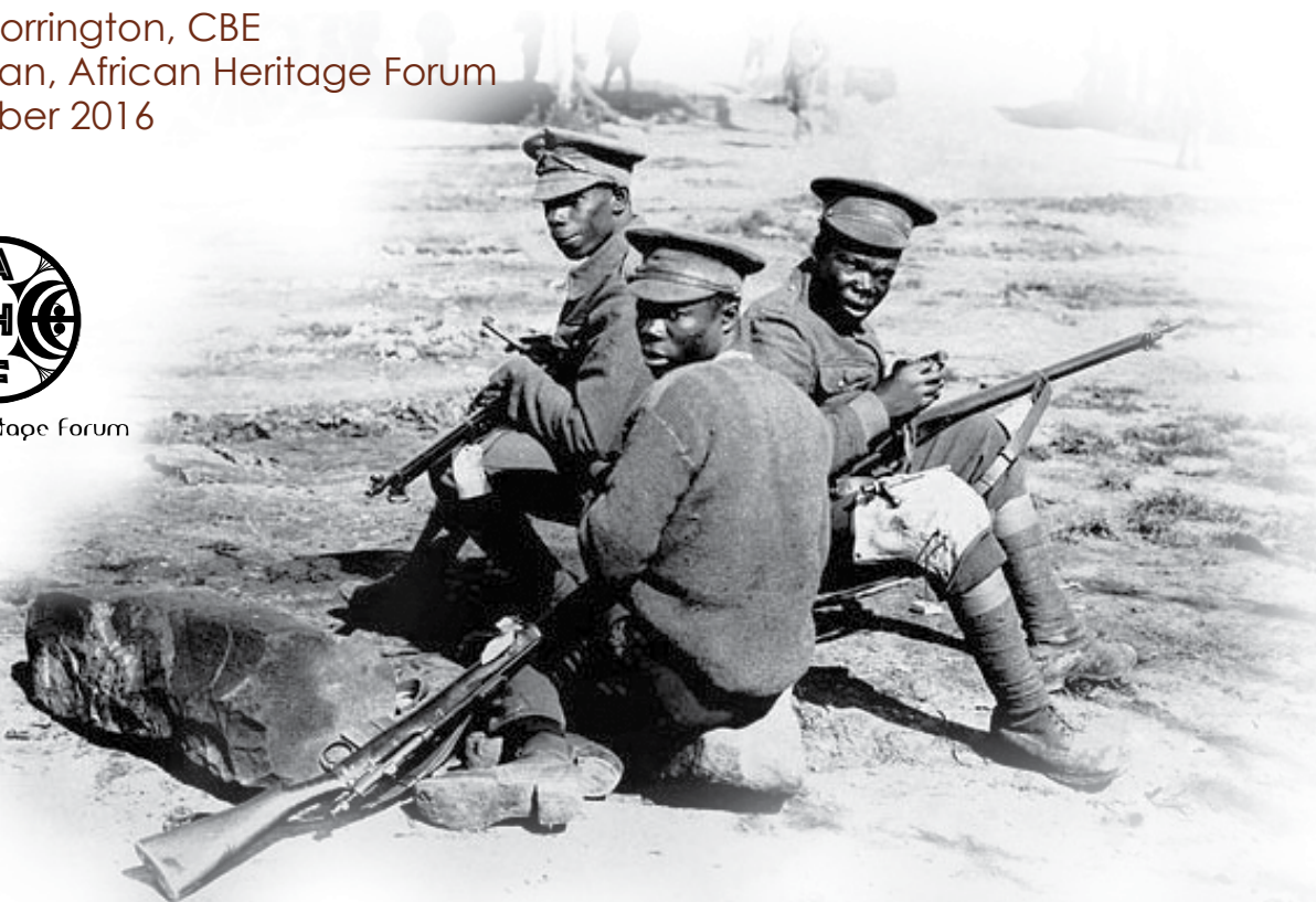
Men from the BWIR on the Albert-Amiens Road during the Somme Offensive 1916 (Imperial War Museum collection: Q1201)