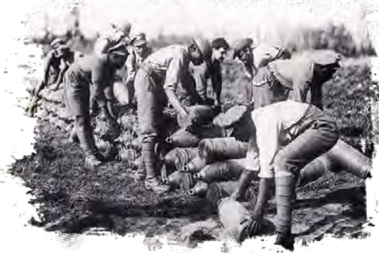
Men from the BWIR loading shells in France

From 1916, the shortage of manpower in Europe needed to be addressed urgently and recruiting was recommenced in the Caribbean. All successive Contingents of men thereafter would be sent to France and Belgium. Lt. Colonel Wood Hill has suggested in his Notes that men from the 3rd, 4th and 6th Battalions were concentrated on ammunition work whereas later Battalions were mostly labour Battalions. 26 A reading of the War Diaries of the 3rd, 7th and 8th Battalions of the BWIR is helpful in providing information as to where men from the Caribbean served on the Western Front and what sort of tasks they were employed in. It appears that all BWIR Battalions that served on the Western Front were involved in ammunition work.