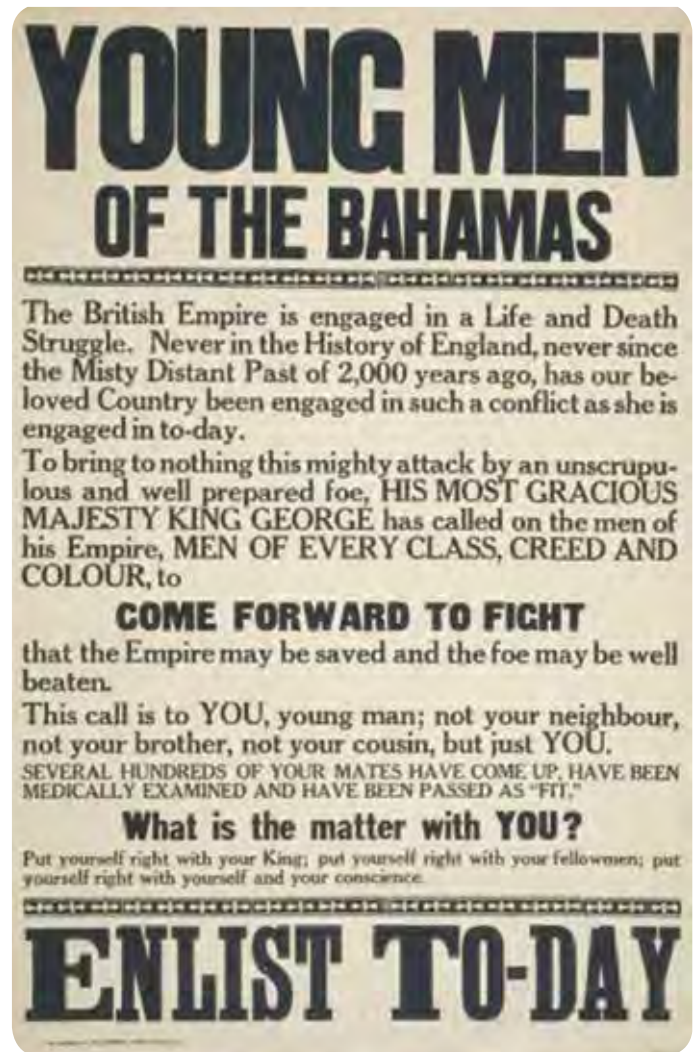
Recruitment poster from the Bahamas calling upon men to fight so that 'the Empire might be saved'.

... government told us that the King had said that all Englishmen must go to join the war.