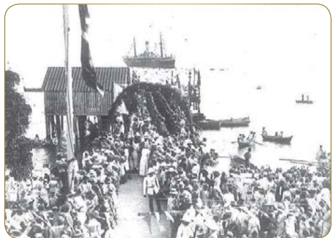
The return of the St. Vincent Contingent in 1919 (Imperial War Museum, Q15098)

To placate the ex-servicemen, they were offered some land in a Land Settlement Scheme and it was decided to encourage ex-BWIR men to migrate to Cuba. The offer of paid passages was taken up by 4,046 ex-servicemen although many desired to go to Canada. Many ex-BWIR became socialists, or nationalists through the Caribbean League, and many turned to Black nationalism in the form of the UNIA and an offshoot called the Ethiopian Progressive and Co-operative Association. 40