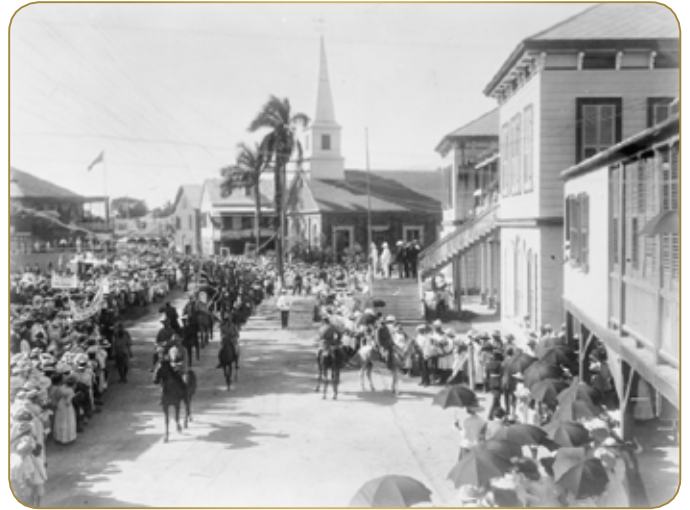
The return of the St. Vincent Contingent in 1919

In Trinidad, the Merchants' and Planters' Contingents had returned in May and June and were mobbed when they arrived. The returning BWIR Contingent was treated differently. As an attempt to head off trouble and pacify the ex-servicemen, colonial officials invited them to lead a parade at the Queen's Park Savannah on 19 July 1919 during the Peace Day Celebrations. However, only 132 men joined the parade, while a number in uniform and civilian dress merely looked on or booed those who were in the procession. The reason for the poor turn-out was due to the refusal to arm those in the parade lest they turned their guns on the authorities. During the peace celebrations some white sailors from HMS Dartmouth were assaulted and a deputation forced the release of some of the military prisoners. The Governor requested white troops be sent to the island and HMS Cambrian was kept there in case of further trouble. In Grenada, there were some disturbances in July 1919. The TTT Gang carried out robberies and arson attacks but some of the gang members were believed to have been ex-servicemen. Other ex-servicemen migrated to Cuba. 41